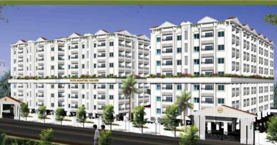
WHITE SIGNATURE PARADISE @ WHITEFIELD, BANGALORE