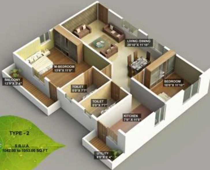
TYPE - 2