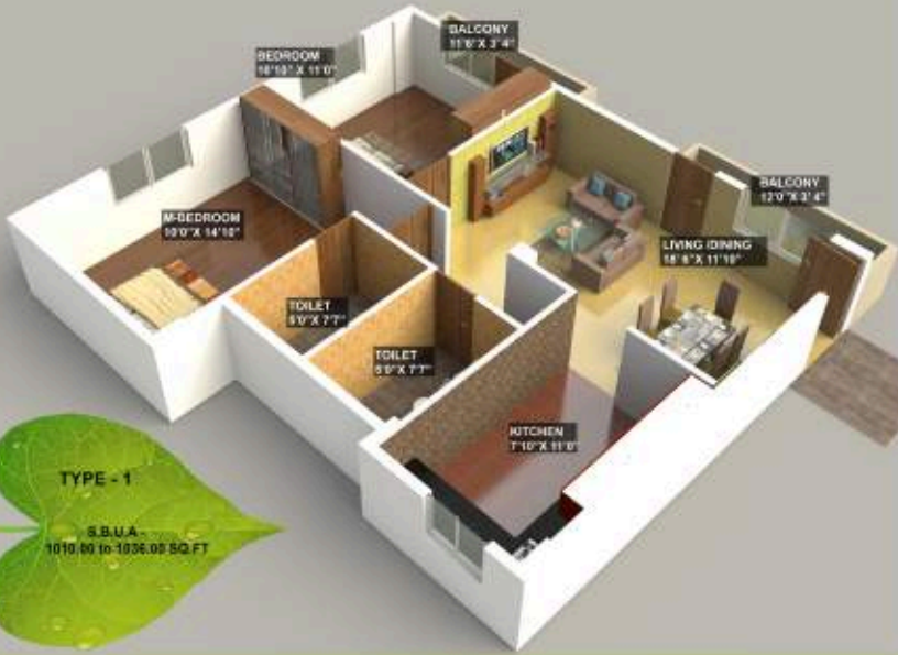
TYPE - 1