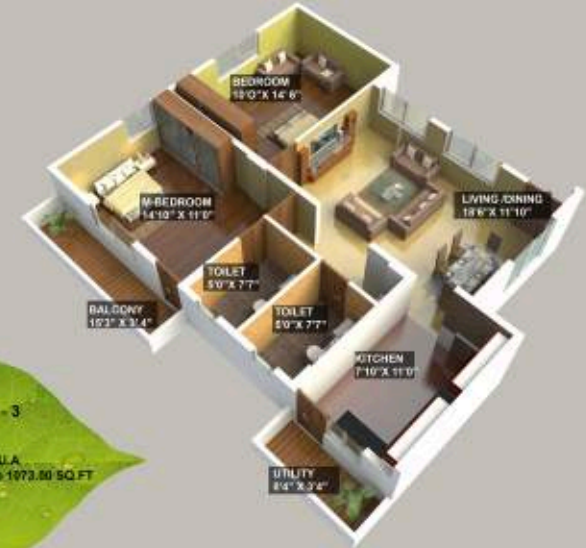
TYPE - 3