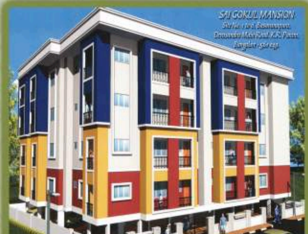
SAI GOKUL @ K.R. PURAM, BANGALORE