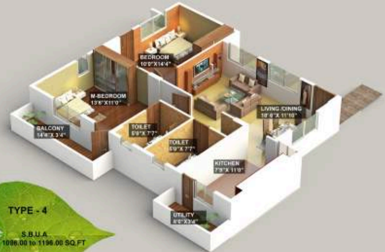
TYPE - 4