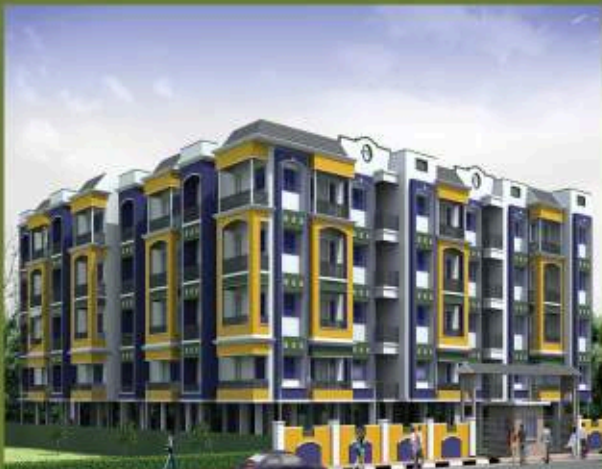
SAI RESIDENCY @ KR PURAM, BANGALORE