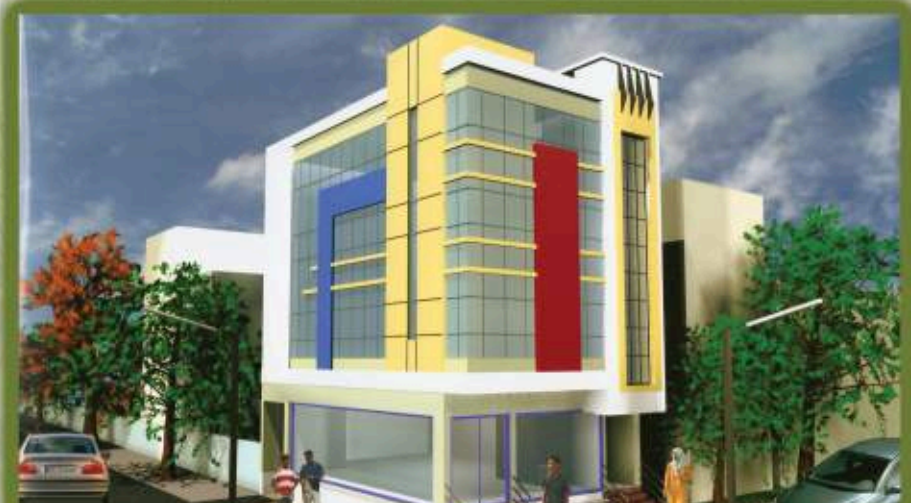
COMMERCIAL COMPLEX @ T.C. PALYA, BANGALORE