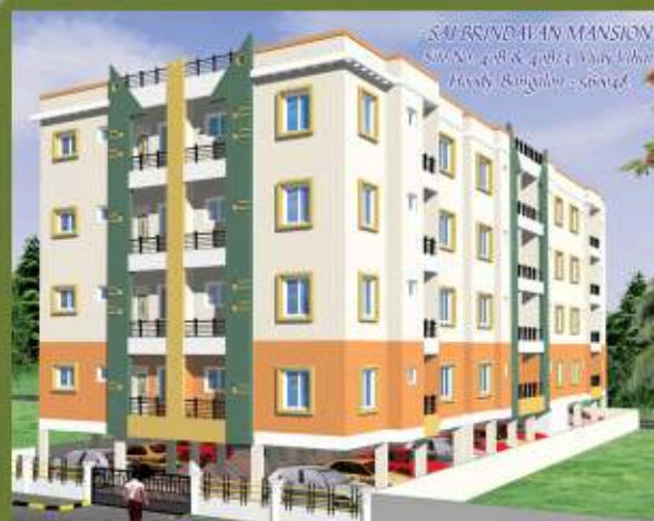
SAI BRINDAVAN @ HOODI, BANGALORE